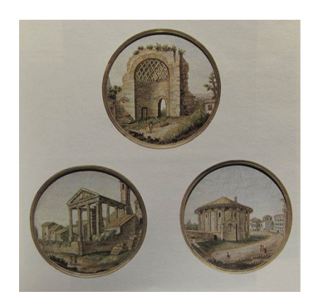
Fig. 11. Roman micromosaic (private collection, Rome)

In the initial phase of his creative work, in the collections of the Crown<sup>8</sup> and the Churches, artist used a geometrized and strongly simplified form which was a synthesis of the architecture of the Gothic churches of Tuscany. He tried to reflect the essence of a given building, using only one of its elements. There were domes, windows and other details that Dari discovered in the Veneto architecture (Venice collection). In the Churches, a sacral building becomes a synthesis of elegance, faith and harmony. Jewellery is a symbol of spirit and moral integrity for Dari, which is why, for example, the Santa Maria del Fiore ring, inspired by the Florence Duomo, does not represent the real building, but its essence – the most important symbolic meaning of faith, symbolized here by a camera-coated diamond ball. Brunelleschi's dome is therefore a visualization of the church, whose treasure is the light of faith, expressed by shimmering stones (fig. 12).