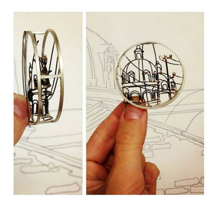
Fig. 29. Jewellery by Caitie Sellers