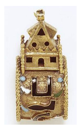
Fig. 8. Jewish wedding ring, V&A Museum, London, inventory No.: 863-1871 Fig. 9. Jewish wedding ring, V&A Museum, London, inventory No.: 866-1871

It should be noted that as early as in the 15th century, Jewish wedding rings with the house or temple of Solomon – like the Erfurt ring – have added motif of intertwined palms from the decoration of fede rings, present in Europe since ancient times<sup>5</sup>. It is also worth noting that in the 19<sup>th</sup> century