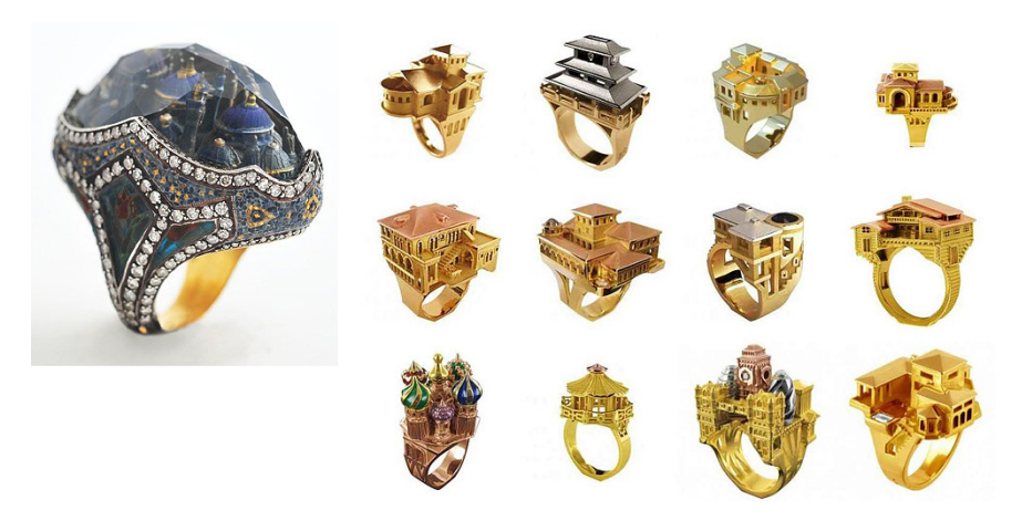
Fig. 23. Sevan Biçakçi, Laleli Ring

Next to the Turkish master, the most popular artist jeweller designing decorative micro-architecture is Philippe Tournaire<sup>15</sup>, working in Paris, the author of city rings (fig. 24). The most creative realizations of the Parisian artist are the collections of Archipolis and Metropolis, in which the city has been included in a synthetic image of various buildings made of gold and expensive stones (these are not copies of specific cities, but rather a synthesis of the city, giving the general impression of the urban agglomeration in the micro version). The Love Temple collection is equally interesting and creative, in which the artist refers to the forms of the Merovingian architectural rings.