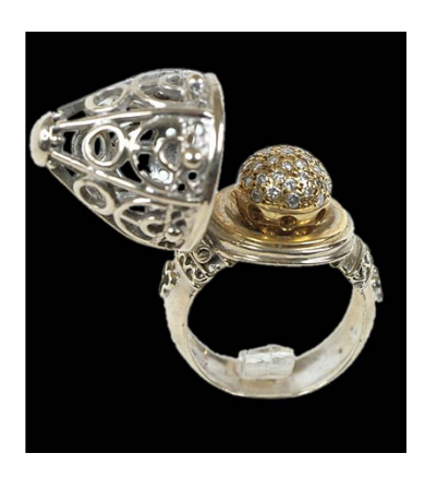
Fig. 12. The Santa Maria del Fiore ring from the collection of Churches