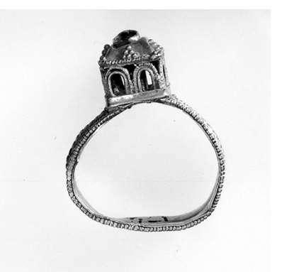
Fig. 5. Architectural Lombardish ring (?), Early Byzantine (?), British Museum, inventory No.: 1872,0604.245, 6^{th}-8^{th} century (place of finding: Lombardia)