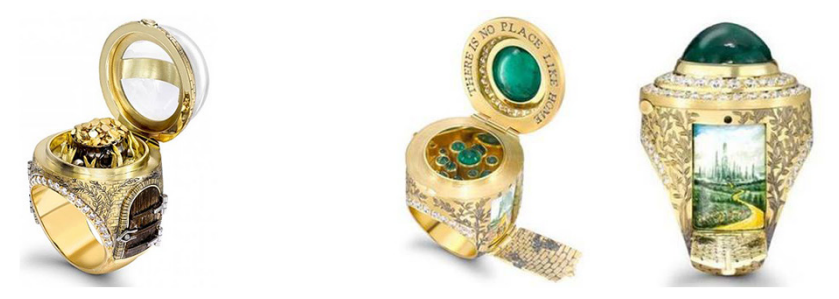
Fig. 21-22. Theo Fennell, At the End of the Rainbow and The Wizard of Oz

doors, drawbridges that open to reveal the secret - garden, road or some wonderful place. Under an expensive stone, often decorating the cover of a can decorating a ring, there are miniature objects referring to history, which the ring illustrates - like a pot with gold in a ring with a graceful name At the End of a Rainbow or an emerald castle in a ring inspired by the story of the Wizard of Oz (fig. 21-22). One could say that Theo Fennell's rings are a microcosm enclosed in a miniature stronghold or hidden under a bowl of a glass sphere, while the use of architectural motifs is not only a formal operation organizing the space of the work, but above all a symbolic image of a wonderful world where miniature doors lead – like those which led to the mysterious garden from the novel of Frances Hodgson Burnett (Secret Garden, released for the first time in 1911 in London). All you have to do is open them to move to a dreamland straight from childhood dreams. The inspiration for a British artist is not a specific work, but a synthetic idea of a mysterious castle, whose sources should be sought not only in children's literature, but also in memories of childhood spent by an artist in Egypt, Pakistan and Singapore.