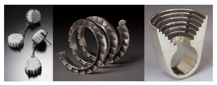
Fig. 30-32. Jewellery by Donna Veverka

miniature copies of fragments of grooved column shafts, which refers to the phenomenon of secondary use commonly found in art, so-called spolises (fig. 30-32).