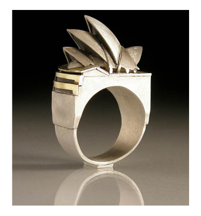
Fig. 25. Philippe Tournaire, French Kiss