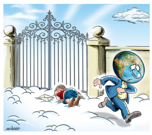
Fig. 16. Metonymy: illustration by Ali Mirae