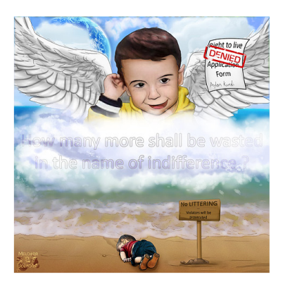
Fig. 22. Rhetoric of consolation: illustration by the artist using the pseudonym/nickname SuperSmurgger