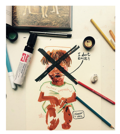
Fig. 36. Gianluca Costantini, Omran Daqneesh - I don't Exist!

The painting presents quite a pale Omran (as if of gypsum) sitting on and orange seat, the headrest of which is bleeding. The semicircles of the breast of the model optically deform the back rest and seem as if concave, as if the boy was about to fall into her body. The model's thighs are very important in the interpretation, since Dinda used here the mentioned-above tactics of 'splitting the frame': the split between the legs of the model, invisible due to the photograph being taken against a dark background, introduces a gap dividing the representation of 'what is' (the right thigh with bombs and ammunition painted on it), and 'what should be' or 'what was' (left leg, showing circular coloured lollipops), as a result of which the entirety becomes embedded in an nostalgic or utopian register.