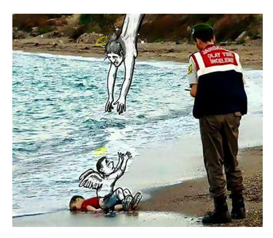
Fig. 21. Rhetoric of consolation: illustration by Dijwar Ibrahim