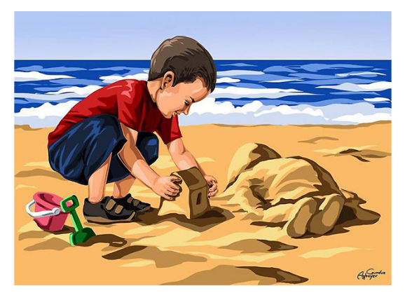
Fig. 7. Re-signing: illustration by Gunduz Aghayev

A different tactic in turn utilises associations related to the spatial context indeed, the beach is a place of relaxation, care-freeness and play. Hence, retaining the original frame, the creators transform the sign itself (to discern it from the practice presented earlier, this one might be referred to as 'resigning'), which remains recognisable through its distinctive features (colour of boy's clothing, dark, short hair). The postulative and critical influence is here analogous to reframing: it is the utopian or nostalgic 'way it should be' that fills the level of the image, whereby the painful 'way it is' remains in the afterimage of the original, but not only that – a close analysis of the image by Gunduz Akhayev shows that the thing that the boy is building out of sand on the beach (or the thing that he already built as he is currently focused on finishing the sand building, seeming as if he would like to lift it and carry it away with himself), is a shape of his own body, the position of which is known to us from the photograph by Nilüfer Demir. This death cast (made by the hands of the deceased himself) violates the smooth homogeneity of the representation – immersing itself into it on the aesthetic level, yet radically separating itself from it on the ethical one (fig. 7).