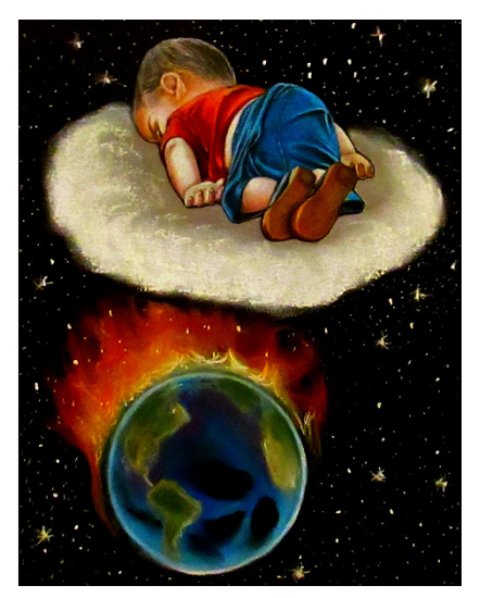
Fig. 15. Metonymy: illustration by Dinko Art

of a turd ('Leaving a Shitty World' – the caption reads<sup>20</sup>) or enveloped with a fiery halo (the Earth is seemingly on fire) which warms the boy's place of rest somewhat (caption: 'A Better Place') (fig. 15). A further image presents him when he's lying – again: on a cloud<sup>21</sup> – in front of a closed gate resembling the edges of rich mansions or state institutions; an unopened letter is found beside the boy (perhaps an asylum request, and behind the gate is an embassy or an authority for migrant affairs), whereby a man in a blue suit (an official?) is attempting to flee the spot and leave this entire affair behind him – the head of the person is the globe of the Earth, drawn on it as if in a cartoon, the face shows fear and terror (is this what drivers fleeing the scene of an accident look like?), the eyes – acting as if against his will – are turned towards that, from which the man is trying to flee (fig. 16)<sup>22</sup>.