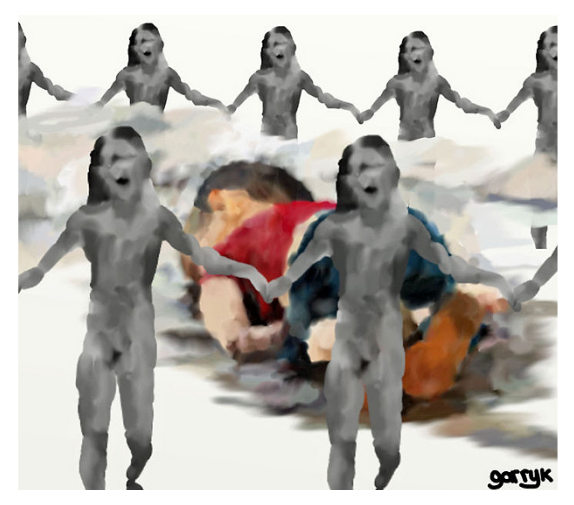
Fig. 11. Image memory: illustration by Garry J. Kendellen