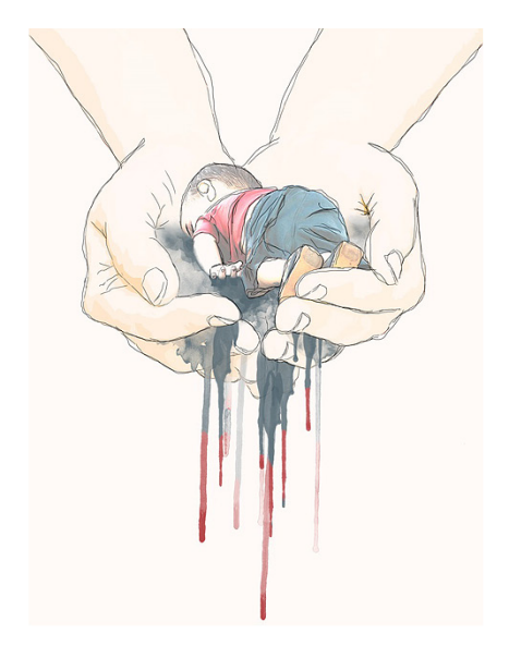
Fig. 14. Synecdoche: drawing by Helen Savvy

human, is in turn a pars pro toto of humanity (fig. 14)<sup>18</sup>. However, what do these images express – save for an empty gesture which is at the same time symbolic, utopian and late, lost for ages? I hear from them one word coming: consolation. I ask: for whom?