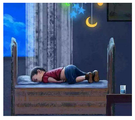
Fig. 3. Reframing: illustration by an unknown artist

The level of the image is dominated by an utopian, counter-real representation ('the way it should be'), whereby its negative reference ('the way it is') hides in the reminiscences ('afterimages') of the original image and is present by way of a network of legible references (fig. 3-4).