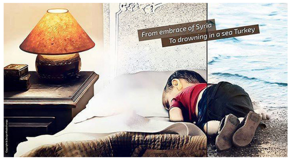
Fig. 5. Illustration by Kayled Karajah

One of these representations – by Kayled Karajah (fig. 5) – sees the artist including an internal frame, dividing the image into two asymmetric spaces: 'the way it should be' ( \frac{3}{4} of the image on the left side) and 'the way it is' ( \frac{1}{4} of the image on the right), or 'the way it was' and 'the way it is'. The sign-body of the boy is symmetrically divided by this vertical section, disclosing a dualised meaning (the left side means sleep, the right – death), and at the same time postulative and critical power, permitting the placement of the message on the level of utopia (the way it should be / the way it is) or nostalgia (the way it was / the way it is), whereby the first of these is appreciated positively as the current desired state.