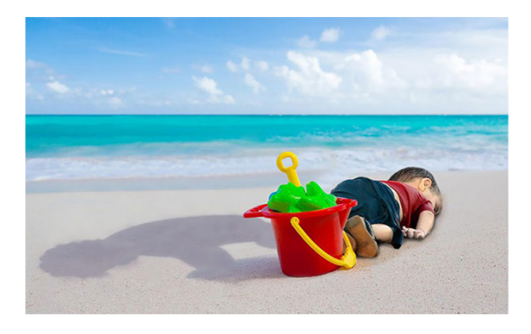
Fig. 8. The sign and its shadow: illustration by Ugur Gallen

Turkish artist Ugur Gallen took a different path. In his illustration – which also has a very calm and seaside convention – the sign-body of the boy is unchanged, but its absent reference (utopian or nostalgic) is seen in the form of the shadow cast by the body-sign, but not being its shadow (as it corresponds to it neither physically, nor semantically). We only see a shadow – index of that which is not there, and what was or should be, playing with a bucket; the place of the boy playing on the beach – removed from the representation, just like he was removed from existence – is taken up by the smooth, celadon surface of the empty sea and a slightly cloudy sky (fig. 8).