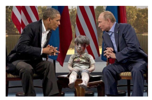
Fig. 33. Omran Daqneesh and 'leaders of the world' - photomontage by an unknown author

the ambulance (fig. 31). However, who among the eight is responsible for what happened? And could among these be perhaps found those who do not deserve to be placed in this context?