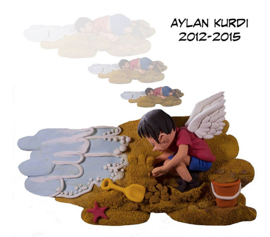
Fig. 17. Rhetoric of consolation: illustration by Edgar Humberto Alvarez