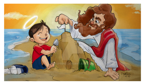
Fig. 18. Rhetoric of consolation: illustration by Asprino Leonardo