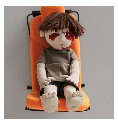
Fig. 27. Doll representing Omran Daqueesh by Romanian artist Dan Cretu, called the 'Sufference Doll'

artists frequently decided to recreate the original shot – and thus, to multiply its frames – forgoing clear interventions such as adding different visual components or verbal commentary<sup>32</sup> (as if they were true to the rule that the image should 'speak for itself').