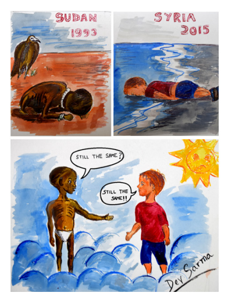
Fig. 13. Image memory: illustration by Hrishikesh Dev Sarma

the same' – replies Alan. The world is still looking how little children are dying, and lets it happen (fig. 13).