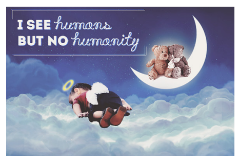
Fig. 20. Rhetoric of consolation: illustration by Mariyana Koleva