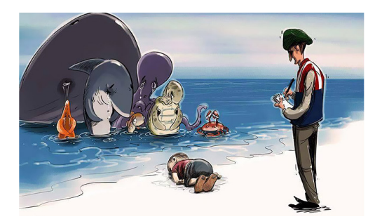
Fig. 23. Cartoon grief: illustration by Azzam Daaboul

innocent soul (fig. 21). Finally, in order for the whip discord to hit human indifference where it hurts most, we make Alan look at his own loneliness, a child's body lying on the shore, but let the onlooking Alan be smiling, may he be – this is getting boring, so I'll stop now, even though I could still go on – sitting on a cloud, may he have wings, and may there be an inscription in the clouds, in semi-transparent Arial: 'How many more shall be wasted in the name of indifference?' (let's add a tiny provocation: the 'No littering' sign) (fig 22).