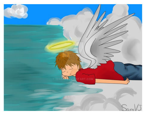
Fig. 19. Rhetoric of consolation: illustration by Sara VJ