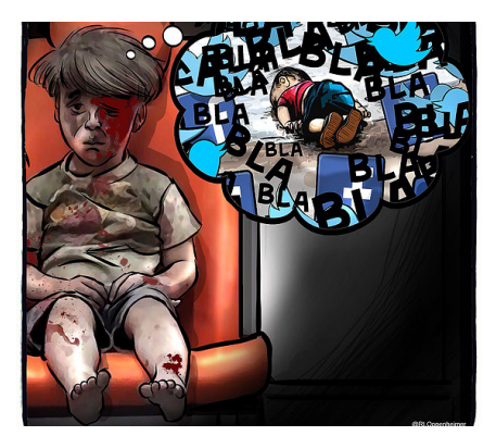
Fig. 28. Omran Daqneesh and Alan Kurdi - illustration by Ruben L. Oppenheimer

However, do these representations not supply arguments that could be used against themselves, when (on the side) they also reveal the permanent inefficiency of production and reproduction of 'images of the pain of others'? Such suppositions strongly come to mind with respect to the image by Ruben L. Oppenheimer (fig. 28), the image by whom seems to rail against the idleness of slacktivism<sup>33</sup>, as it was chosen to be published on... Twitter, hence, willingly or not, he generated what he turned against (retweets, likes, shares, approving comments, etc.)<sup>34</sup>. Khalid Albaih, in turn, a Romanian-born Sudanese illustrator, referring to himself as a 'virtual revolutionist'<sup>35</sup>, showed the figures of Omran and Alan to depict two possible scenarios of a tragic alternative, to which Syrian children were left: what you will experience if you stay (Omran Daqneesh), and if you leave (Alan Kurdi) (fig. 29). More critical, in the area of heartbreaking, is the image showing