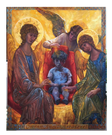
Fig. 34. Judith Mehr, Omran, Angels Are Here (2016), oil on canvas

spectacular – depiction of this rhetoric, and it was fused with a veritable canonisation of the boy – not an on-line remix, but an oil painting by US painter Judith Mehr entitled Omran, Angels Are Here , visually referring to the Trinity icon (ca. 1410-1427) by Andrei Rublev. Three angels surround the sitting boy, with an inscription in their halos: 'joy – peace – hope' respectively in Arabic, English and Latin; the entirety is framed with an 'Arab-looking' ornament, and the top of the image bears the inscription 'peace be with you' (in Arabic), the bottom – the title of the painting (in English) (fig. 34).