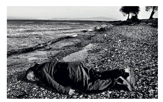
Fig. 24. Ai Weiwei on the Lesbos beach