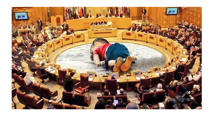
Fig. 9. 'Look what you have done' - illustration by anonymous Internet user

In this case, each time we experience the question, whether the message was correctly addressed. Different illustrations point their J'accuse in different directions, placing the blame on the UN (and the relations of the West with the Arab world: secret arrangements, weapons for oil deals, hidden circulations of petrodollars, etc.), on the Arab world (with its endless wars)<sup>13</sup>, on the EU (with its foreign policy, the work of the Frontex, etc.)<sup>14</sup>. This sheer multitude of potential guilty parties dissolves the voice of reproach and opposition from the powerless and mute body of the boy, entangling it in a network of rhetorical fights which almost exclusively aim at shifting responsibility on to others. From 'a stone and a petrol bomb', the boy's body becomes a 'rotten egg' or 'hot potato' from the children's play, hastily thrown to someone else's hands, which all remain unblemished (fig. 9)<sup>15</sup>.