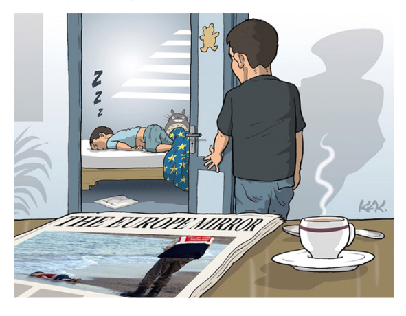
Fig. 6. Doubling the frame: illustration by French illustrator Kak