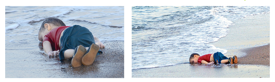
Fig. 1-2. Alan Kurdi on the beach in Bodrum

the boy from the direction of his feet (fig. 1.), the other is horizontal, and was made from the left side of the boy, about five metres from the body (fig. 2).