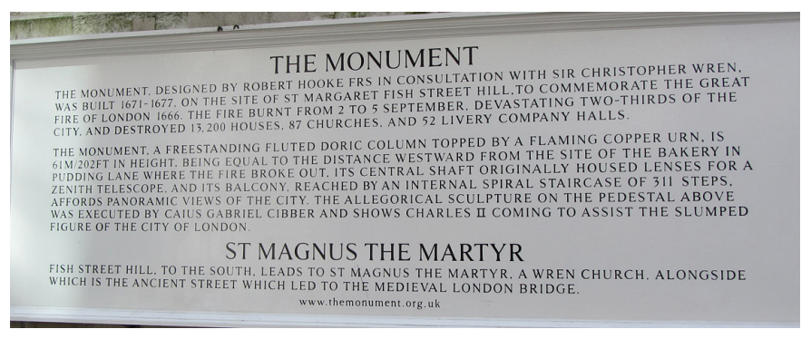
Fig. 6. Information on the Monument