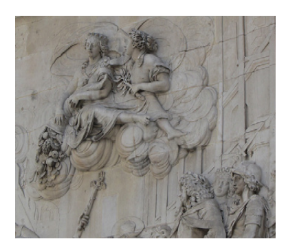
Fig. 10. Two goddesses with a cornucopia and a palm branch