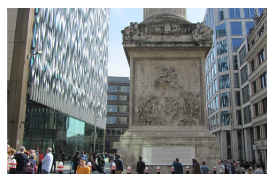
Fig. 7. Caius Gabriel Cibber's plinth

The North side carries information about the fire itself, how it started, how much damage it caused, and how it was eventually extinguished (fig. 6). The role of King Charles II in fighting the blaze is described on the South side, and the history of building the Monument on the East. The West side features an allegorical re-