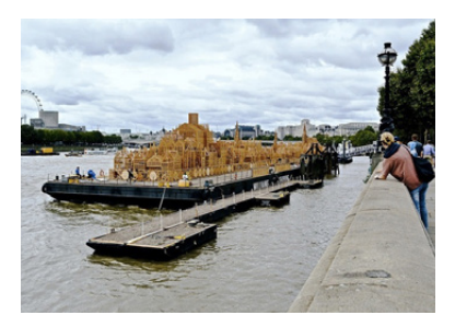
Fig. 12. Wooden replica of the seventeenth century London