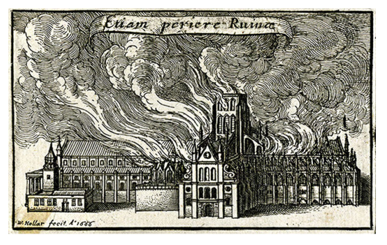
Fig 1. Old St Paul's Cathedral burning in the Great Fire, etching by Wenceslaus Hollar, in possesion of the British Museum

The Great Fire lasted until the 5<sup>th</sup> of September. It devastated 87 of the existing 109 churches (including St. Paul's Cathedral), burned 52 livery company halls<sup>19</sup>, numerous civil administration buildings