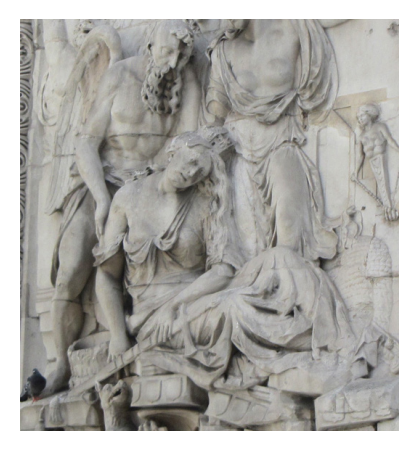
Fig. 8. The figure of a woman representing London

Various authors, commenting on the Monument's allegorical message, drew attention to particular details. Robert Seymour observes that Cibber's sculpture presents in stone what the South side inscription reveals in words, i.e. praise of Charles II, who 'commiserating the deplorable state of things, whilft [whilst] the ruins were yet smoaking [smoking], provided for the comfort of his citizens, and the ornament of his city'33. John Noorthouck notes that the beehive shows that 'by industry and application the greatest misfortunes may be overcome'<sup>34</sup>. An alternative (or additional) interpretation which could be offered, based on Christian symbolism, would read the beehive as denoting