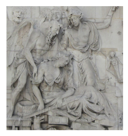
Fig. 11. The figure of Time (Kairos)

'a pious and unified community'<sup>35</sup>,which would highlight Londoners' common purpose and shared belief. Christoph Heyl focuses on the figure of Time (fig. 11) stating: