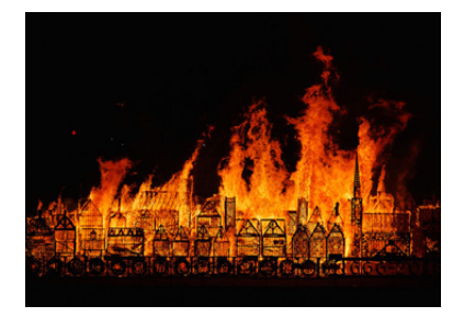
Fig. 13. London's Burning – 350<sup>th</sup> anniversary of the Great Fire

the way for the building of the modern city<sup>'45</sup>, which 'devastated the capital and forced it into a rebirth<sup>'46</sup>, and which 'shaped the London we know now<sup>'47</sup>. Much attention was given to 'the London of today [...] built from the ashes of the wooden city<sup>'48</sup>, 'the capital's resilience [which] helped it rebuild and survive<sup>'49</sup>, 'the great city we enjoy today [which managed to] rise from those ashes, develop and thrive<sup>'50</sup>, 'the resilience of London and its people in rebuilding their City<sup>'51</sup>, and 'the city's ability to rebuild and thrive<sup>'52</sup>.