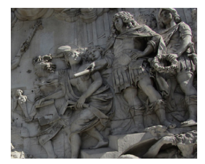
Fig. 9. King Charles II offering suport