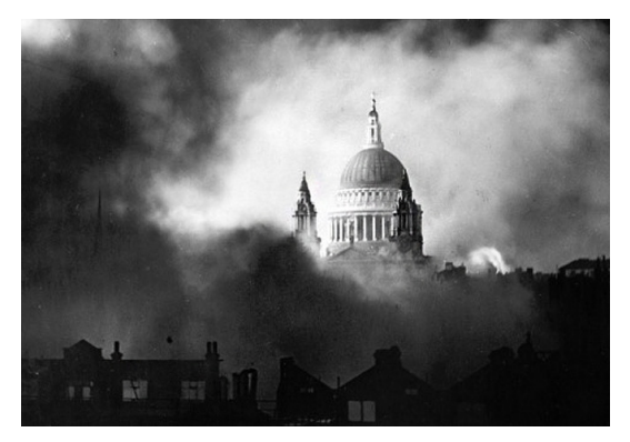
Fig. 15. St Paul's Cathedral during the 1940 blitz

and the Cathedral was severely damaged, 'the image of the dome with its cross held high above the tumultuous smoke and the glare of flame was seared into Londoners' imagination: the image of survival'<sup>72</sup>. The 1940 photograph of Wren's magnificent dome towering over destruction became an iconic representation