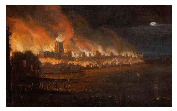
Fig. 2. An anonymous oil painting of the Great Fire, the view taken from the West

and courts, totally obliterating the city infrastructure and making around 100 000 people homeless (fig. 1). It levelled approximately 436 acres of space. In the words of a British historian: '[Fire] laid waste five sixths of the walled area of the medieval city, from Fleet Street in the west to the Tower of London in the east, and north from the bank of the Thames to the wall at Cripplegate. [...] Within the area of the fire no buildings survived intact