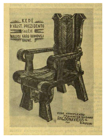
Fig. 2. Project of an armchair for the President's reception room by Gerardas Bagdonavičius