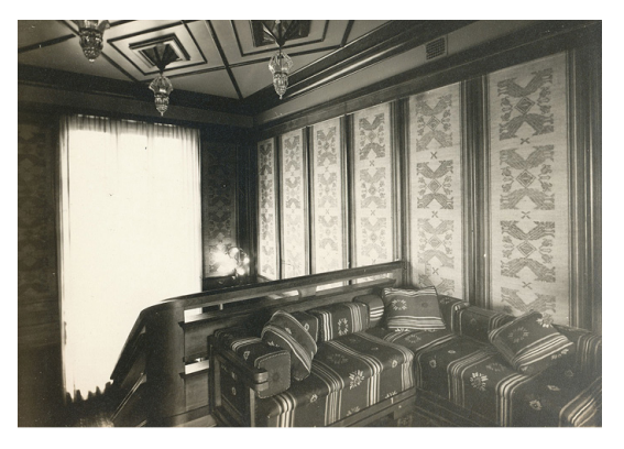
Fig. 6. Jonas Vailokaitis' living house interiors in Kaunas, arch. Arnas Funkas

Following the forms of folk art and crafts, the professional artists tried to replicate the typical primitive nature of folk arts, but freely reproduced and interpreted them. High-quality, single- or limited-edition elements of the National Style interior corresponded