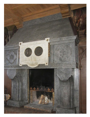
Fig. 3. The fireplace in the Lithuanian Military Officer's Club in Kaunas, Vytautas the Great Sitting room