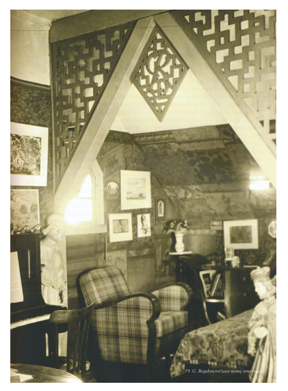
Fig. 10. G. Bagdonavičius home interior.

This chapter aims to reveal different forms of the conception of the national, which existed during the interwar period in Lithuania. They were determined by the tradition, religion and