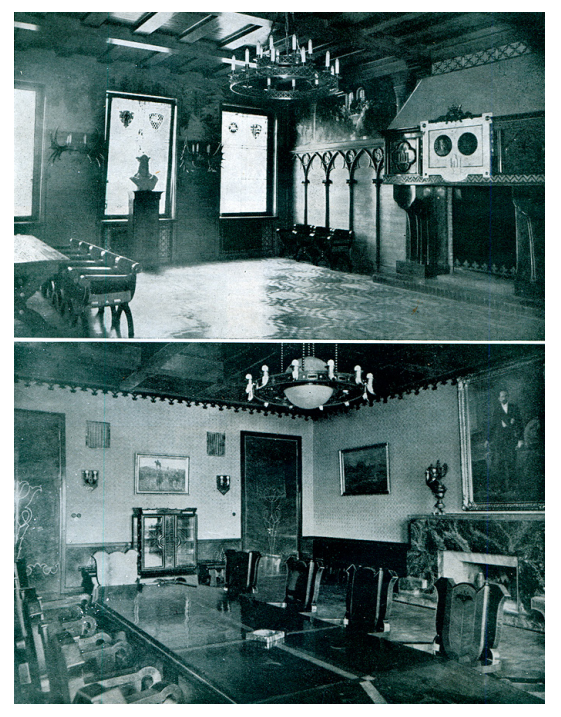
Fig. 1. The interiors of the representative room in the Lithuanian Military Officers' Club in Kaunas: Vytautas' the Great Sitting room (top), President's Reception hall (bottom)

The portraits of Vytautas the Great, the maps of Grand Duchy of Lithuania, architectural land-