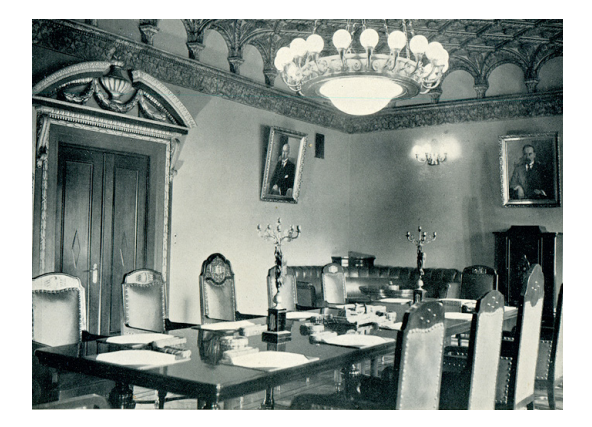
Fig. 8. The Conference Room in the Bank of Lithuania