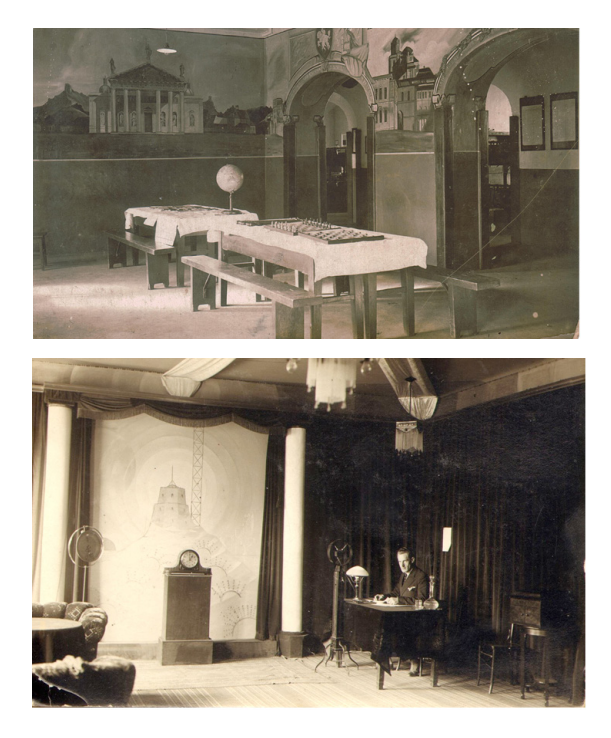
Fig. 4. Library room in Lithuanian Army's Duke Vytenis' 9<sup>th</sup> infantry's regiment, 1930–1940