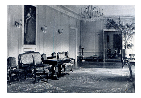
Fig. 7. President's Antanas Smetona's Reception hall